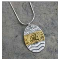
Jascha Sonis Jewelry