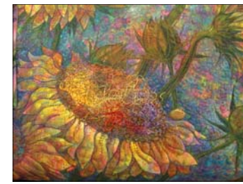
Olena Nebuchadnezzar Art Quilts