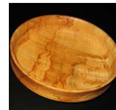
Toby Fulwiler Woodwork