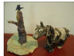
2011 Clay Studio Student Show, work by Caroline Gibbs